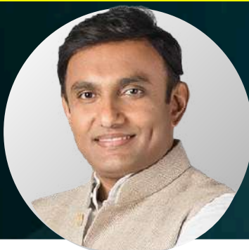
Dr. K. Sudhakar

Chairman Shantha Group of Institutions Member of Parliament (Chikballapur Constituency)