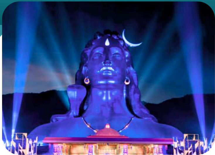
ADIYOGI ISHA FOUNDATION